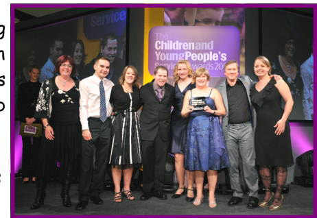
Pictured here are members of the Youth Work Team receiving an Award from former Blue Peter Presenter Peter Duncan.

Both were outstanding achievements of which we are very proud!